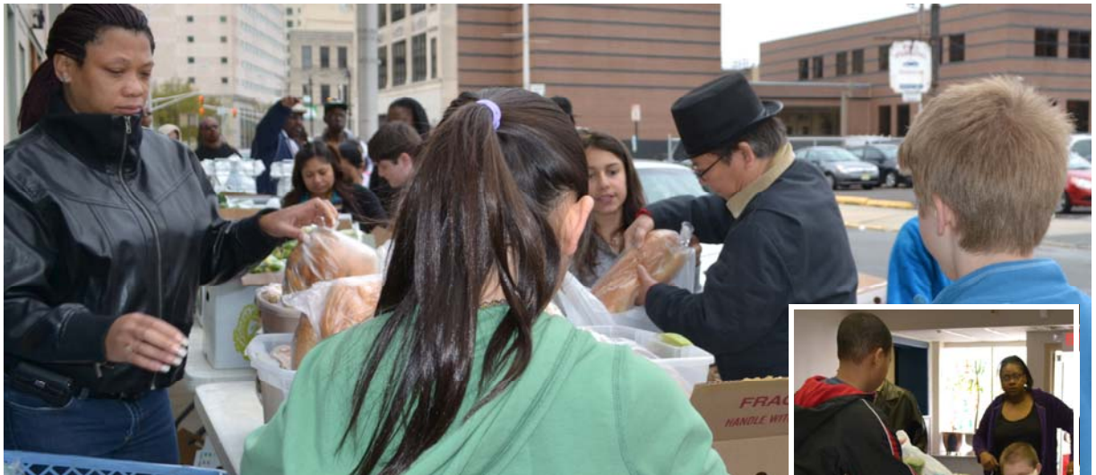
Students from the Pennington School came to the Crisis Ministry's downtown Trenton store this spring to work at our free Friday Farmer's Market. Our outdoor market serves up to 300 households each week with fresh vegetables and fruits, plus donated soups, breads, yogurts, and more. Above, students work with Harvesting Hope participants to assist the Market's visitors. At right, two students bag fresh produce inside the store.

Save the Date for the Crisis Ministry's Fall Benefit— Friday, October 21 In the Johnson Education Center of D & R Greenway, Princeton Watch for details!